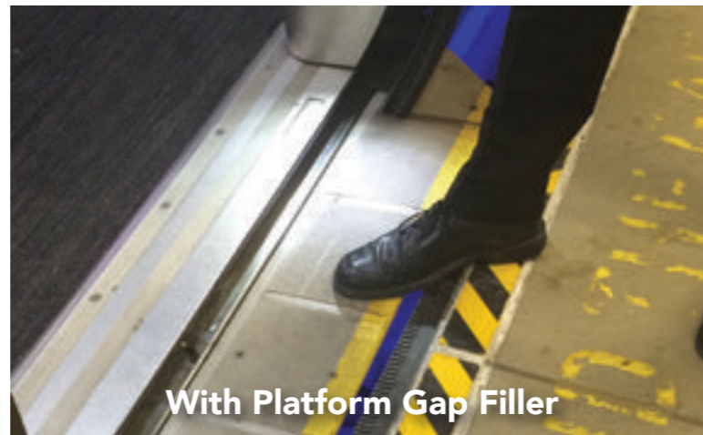
With Platform Gap Filler

Platform Gap Filler is an engineered sturdy, hard-wearing rubber profile that is mounted along the edge of a train platform to reduce the gap between the platform and the entrance of a passenger train; ensuring that when a train has stopped at a platform, passengers are able to enter and exit with safety.