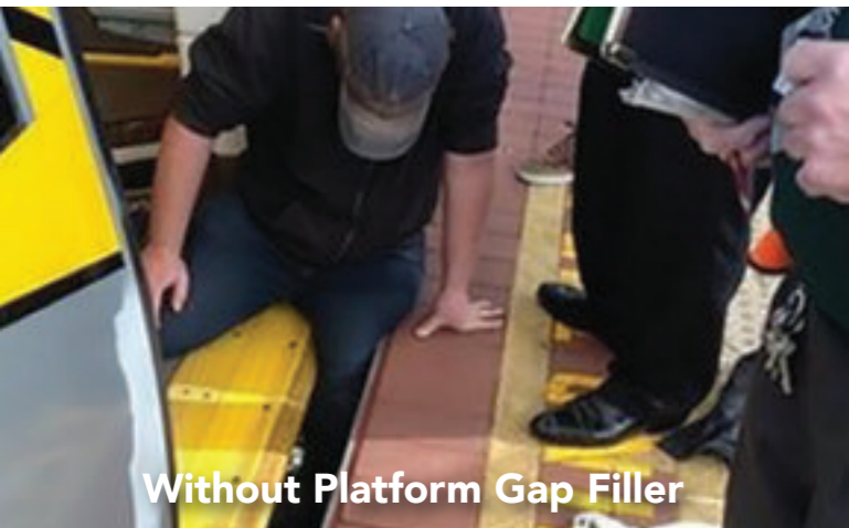
Without Platform Gap Filler